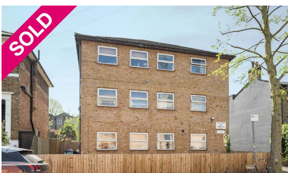
Constance Court, Peckham