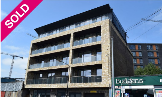
The Old Smoke House, Canning Town