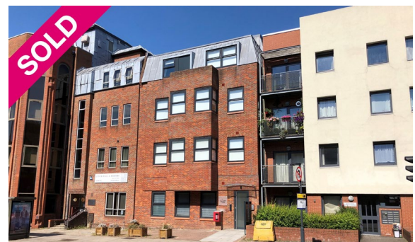
27 Peterborough Road, Harrow