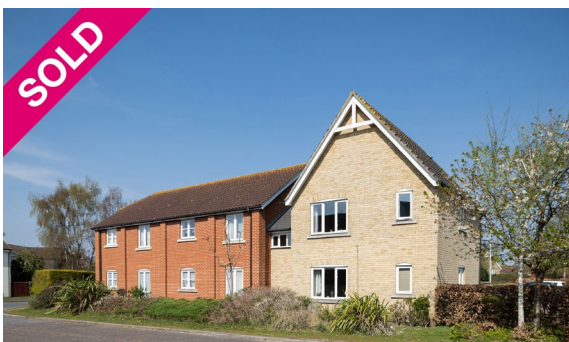
Higgins Place, Martlesham Heath, Ipswich