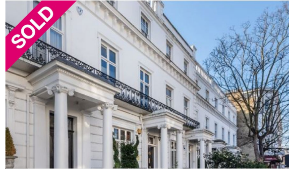
10 Thurloe Street, South Kensington