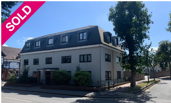
Stuart House, Halfway Street, Sidcup