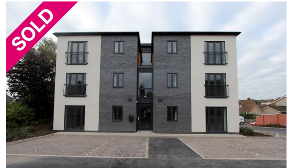
Stanbridge Court, Bristol