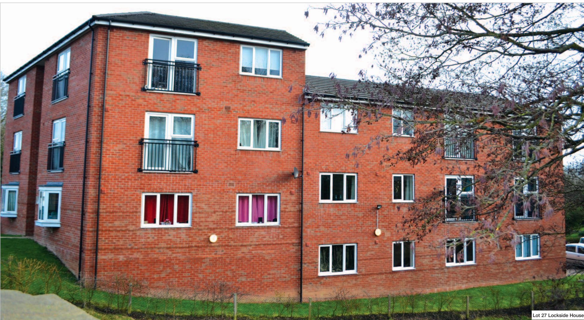
Lot 27 Lockside House