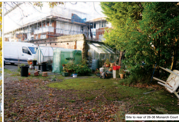
Site to rear of 26-36 Monarch Court