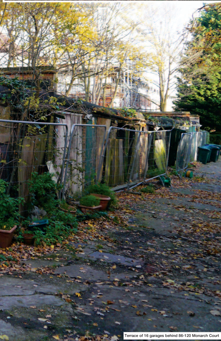
Terrace of 16 garages behind 86-120 Monarch Court