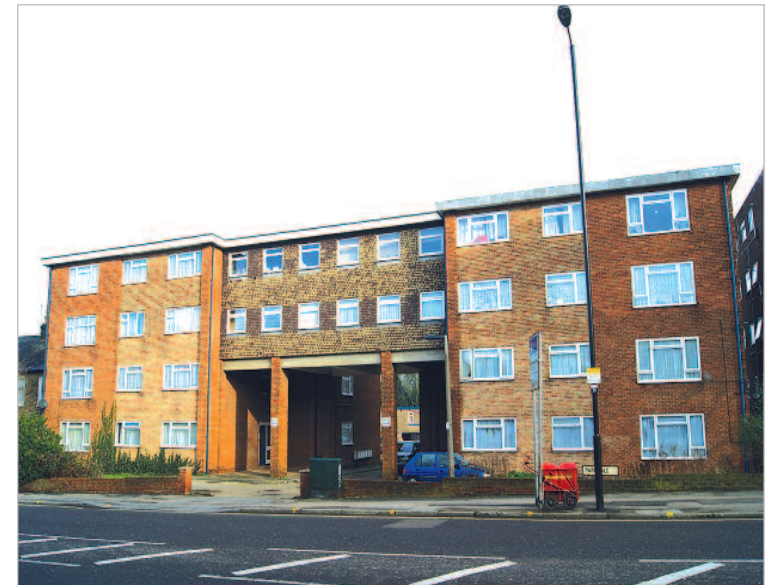
VACANT – Leasehold Flat