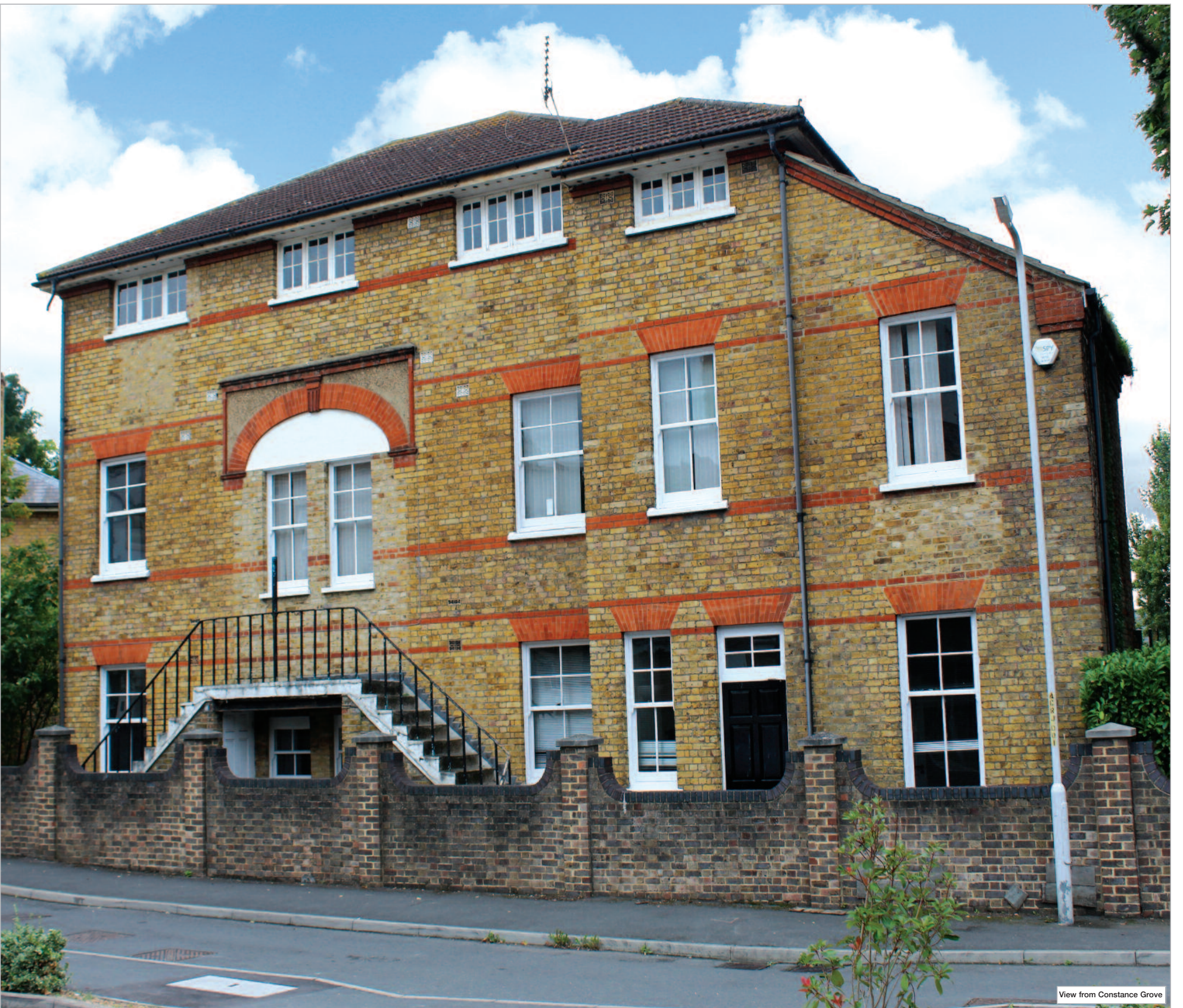
View from Constance Grove