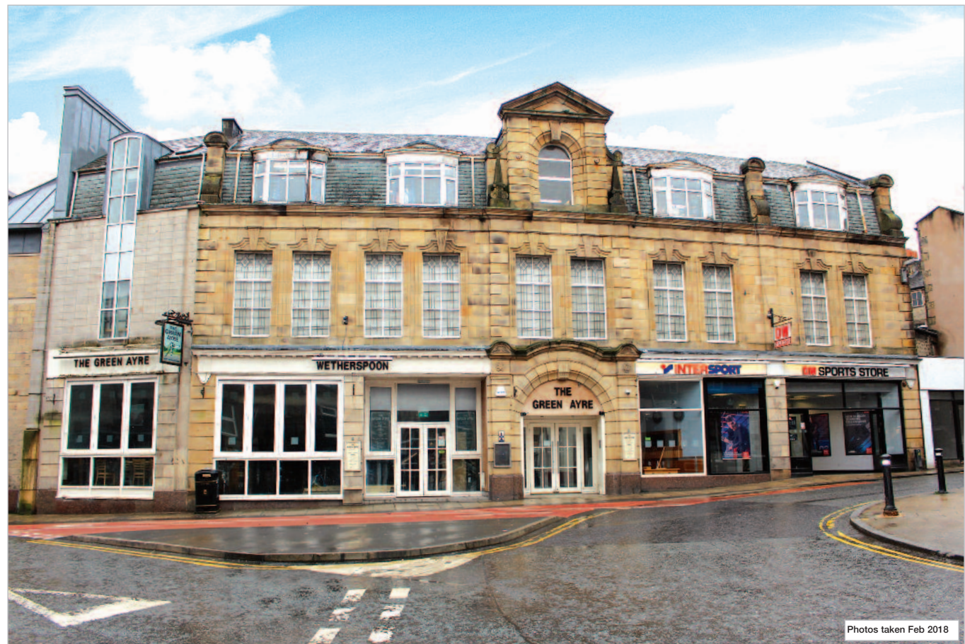
Photos taken Feb 2018