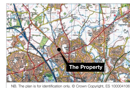
NB. The plan is for identification only.