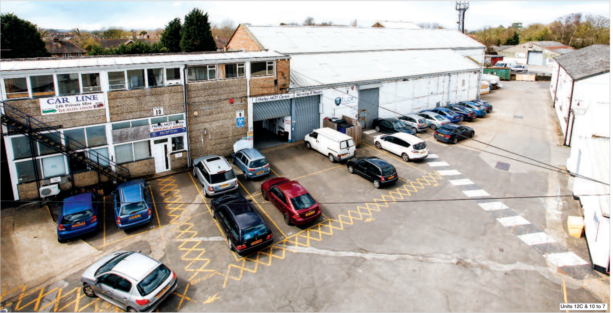
Units 12C & 10 to 7