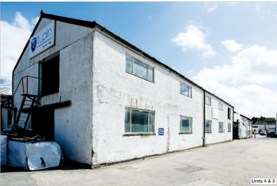
Units 4 & 3