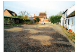
Freehold Former Public House, Cottages and Site