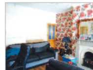
INVESTMENT – Freehold House

Current Rent Reserved £4,160 per annum (equivalent)