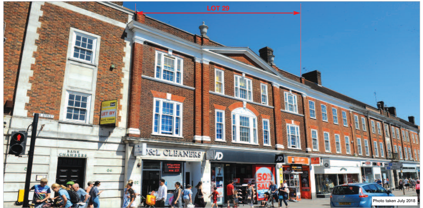
Photo taken July 2018