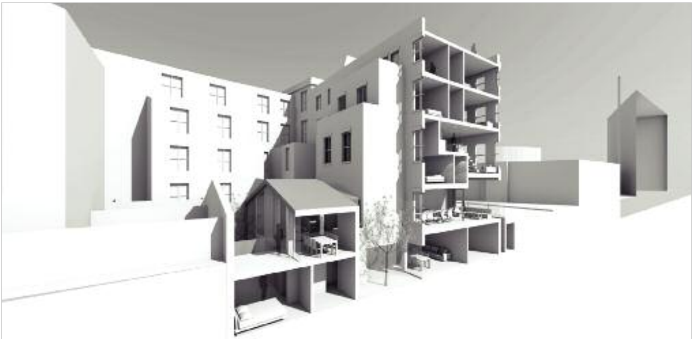
3D Section of Proposed Development as Viewed from the Rear