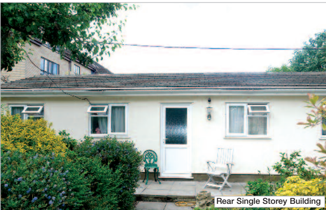
Rear Single Storey Building