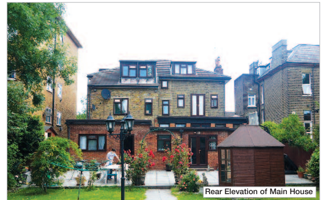
Rear Elevation of Main House