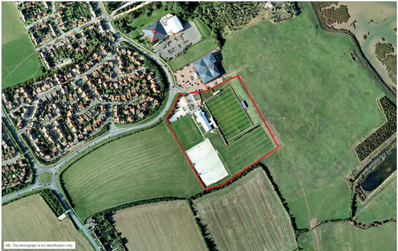
NB. The photograph is for identification only.