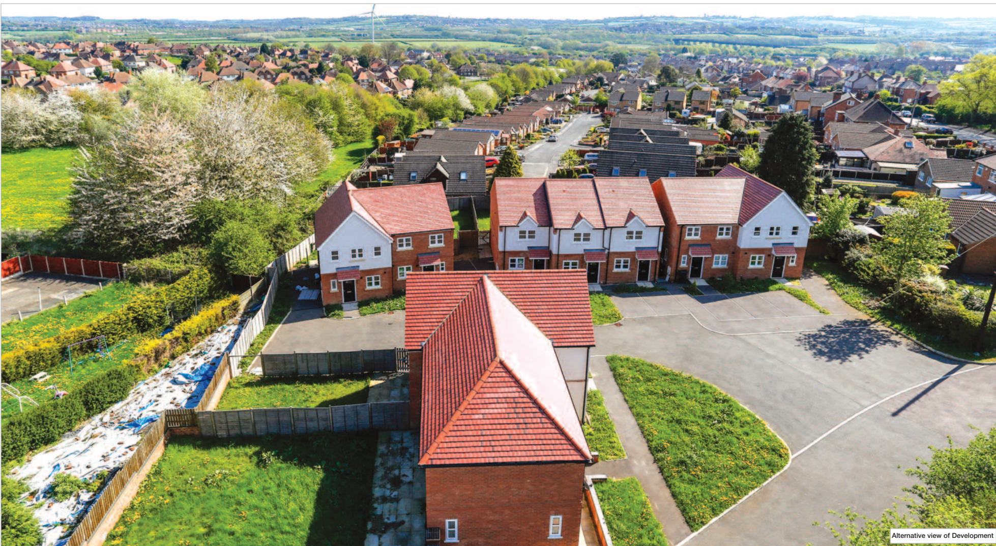
Alternative view of Development