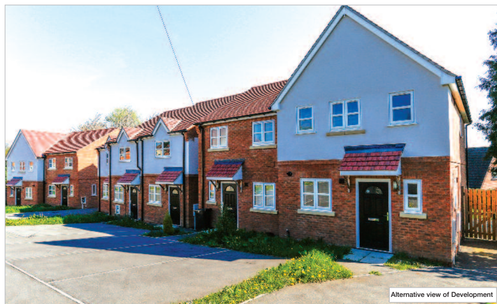
Alternative view of Development