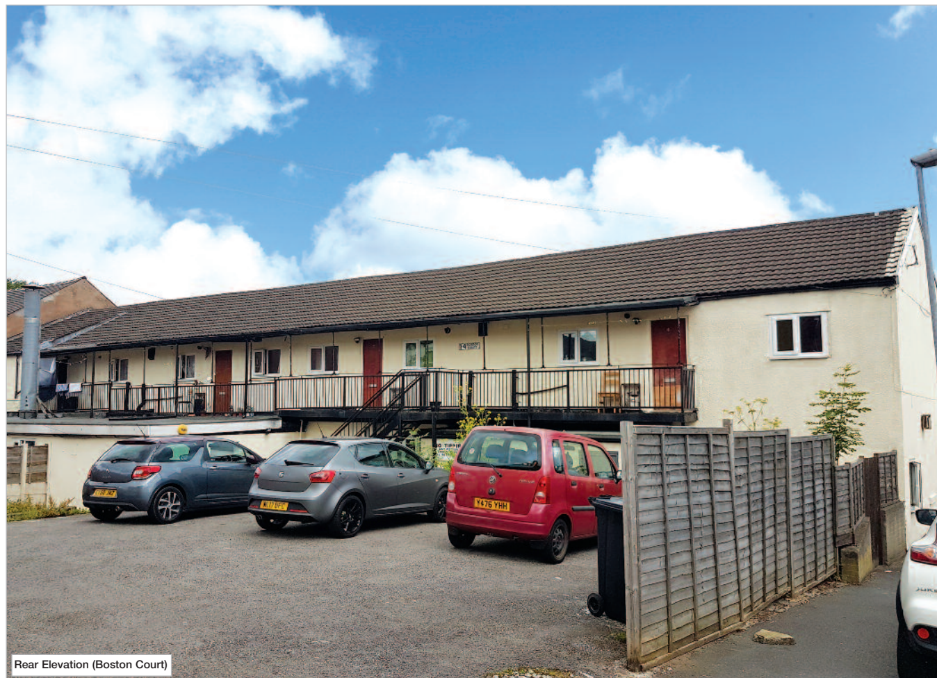
Rear Elevation (Boston Court)