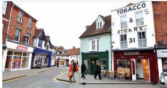
Kingsbury Square Frontage