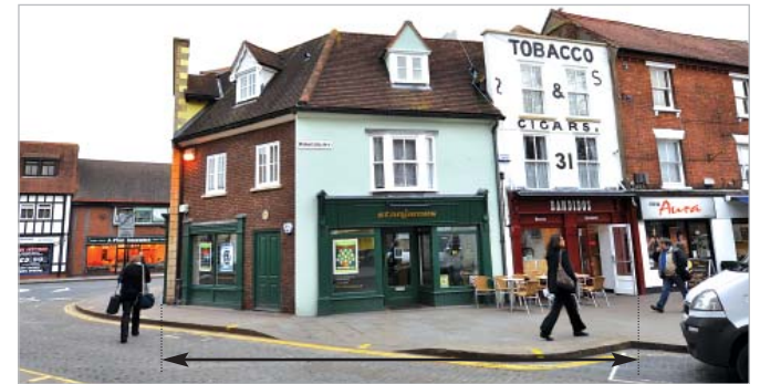
Kingsbury Square Frontage