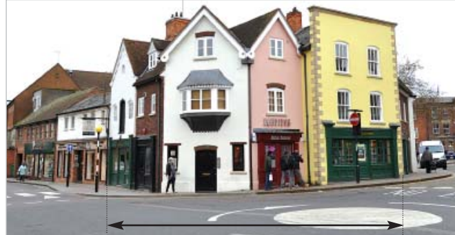
Buckingham Street Frontage