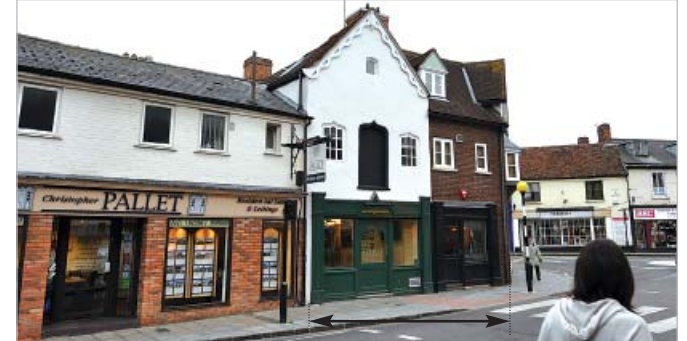
Buckingham Street Frontage

There is a large sub-let restaurant in the basement which has access via an independant access in Buckingham Street and from the small shop unit on Kingsbury Square. The upper floors comprise residential accommodation which has been sold on a long lease.