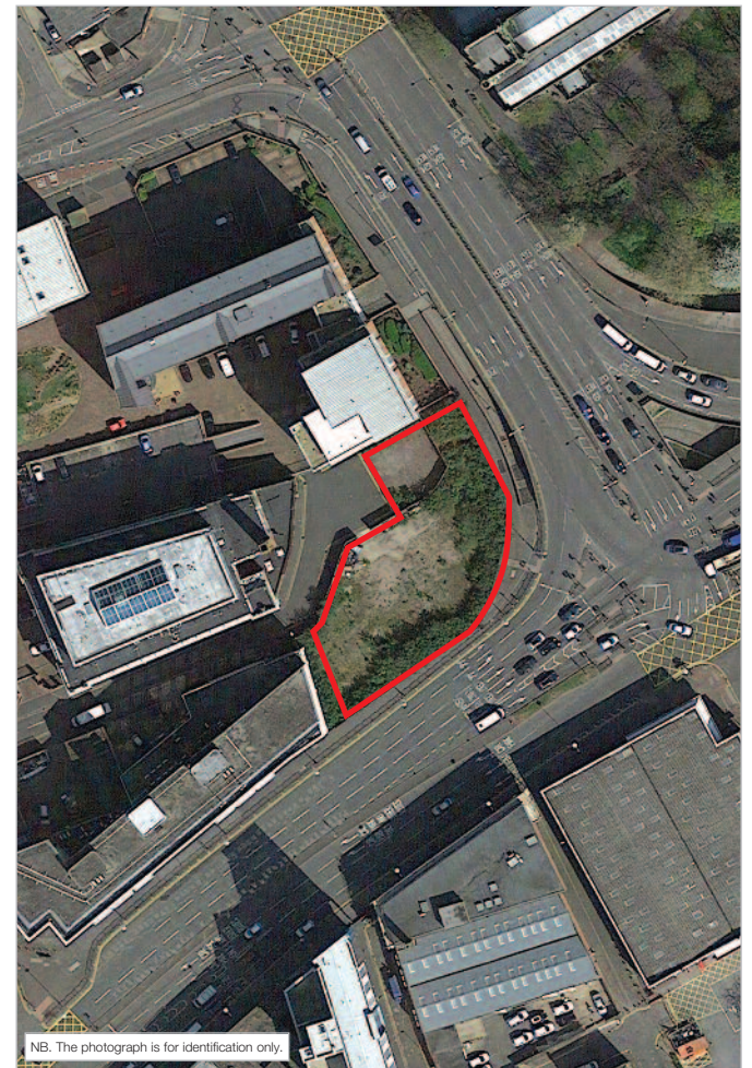
NB. The photograph is for identification only.

The property is centrally located on the north side of Vaughan Way, at its junction with St Margaret's Way. Leicester city centre, with an extensive range of shops and other facilities, is close by. Leicester Rail Station is 1.3 miles to the south-east. Local schools and colleges are within a two mile radius of the property including Leicester College 0.5 miles north-east and De Montfort University 1.5 miles south. The open spaces of Abbey Park are to the north and the River Soar is to the west. Both the M1 and M69 Motorways are accessible.