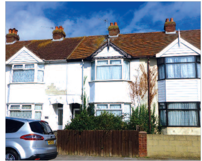
VACANT – Freehold House