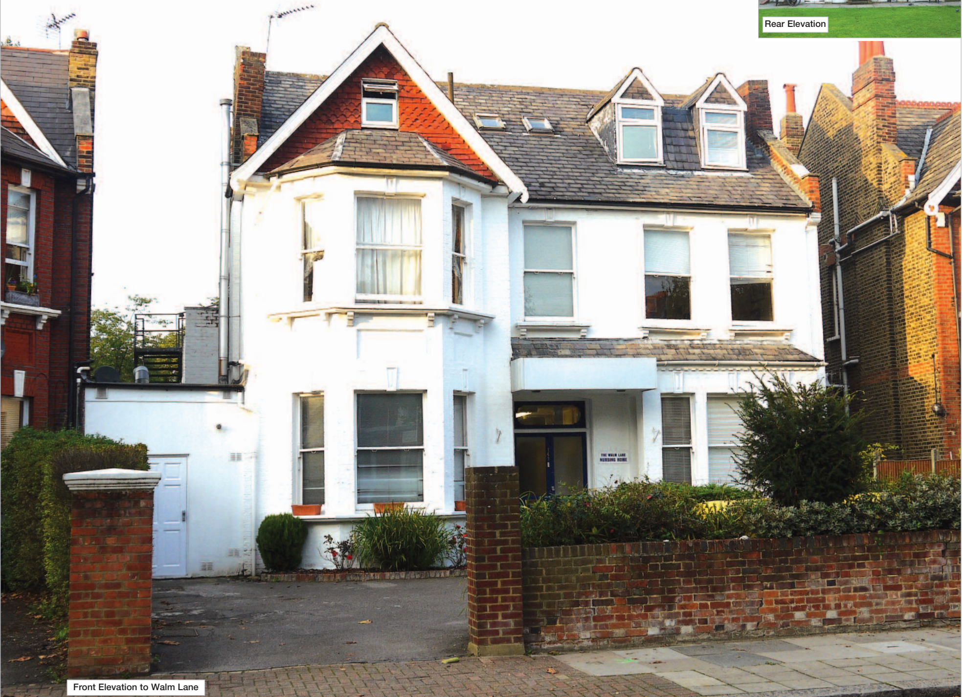
Front Elevation to Walm Lane